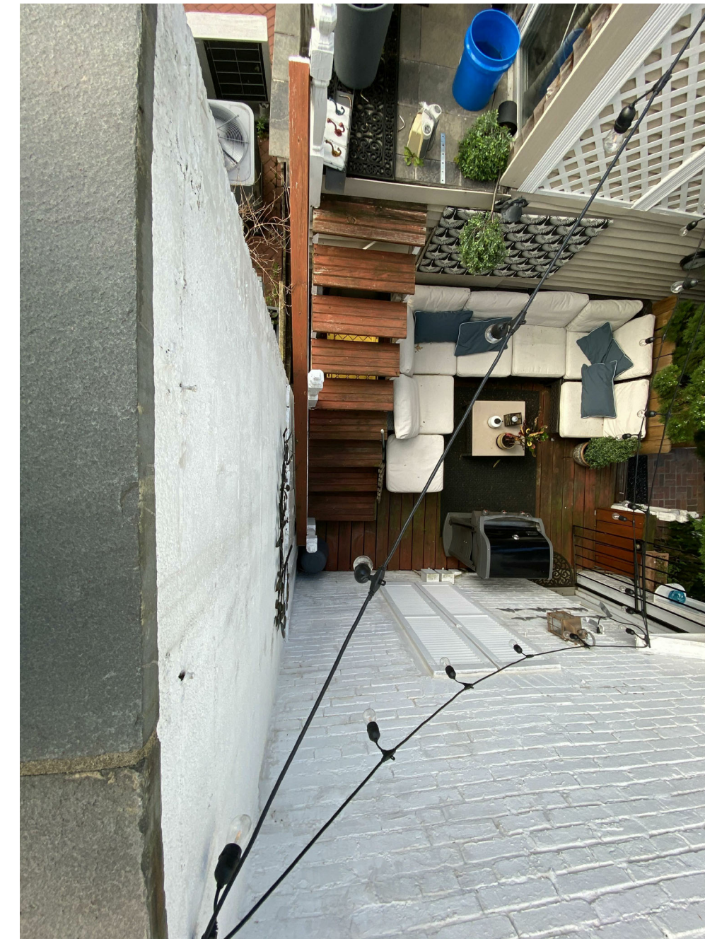
VIEW OF RIGHT SIDE NEIGHBOR'S YARD