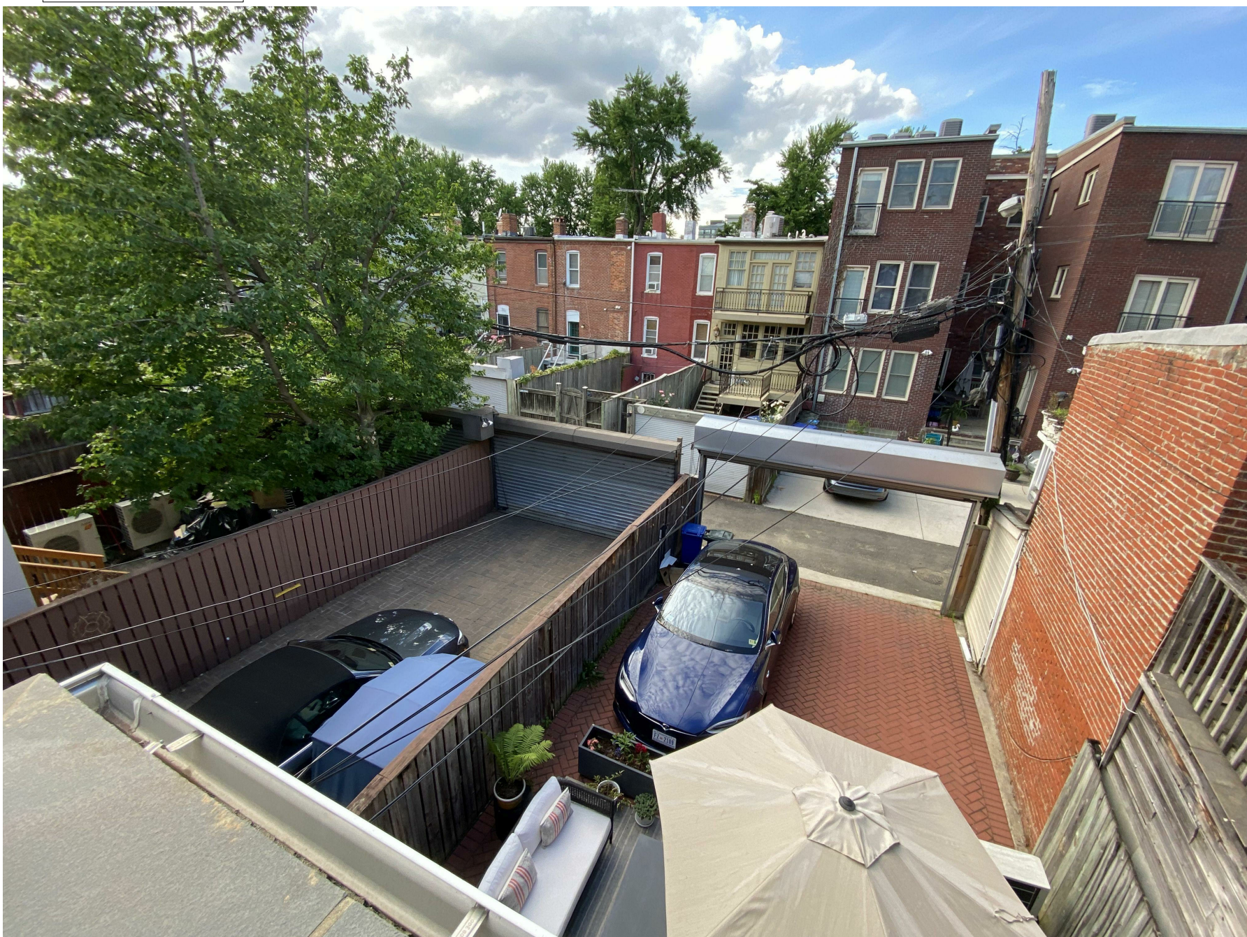
VIEW FROM EXISTING BALCONY