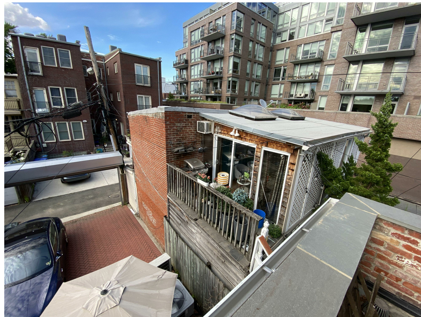
VIEW FROM EXISTING BALCONY