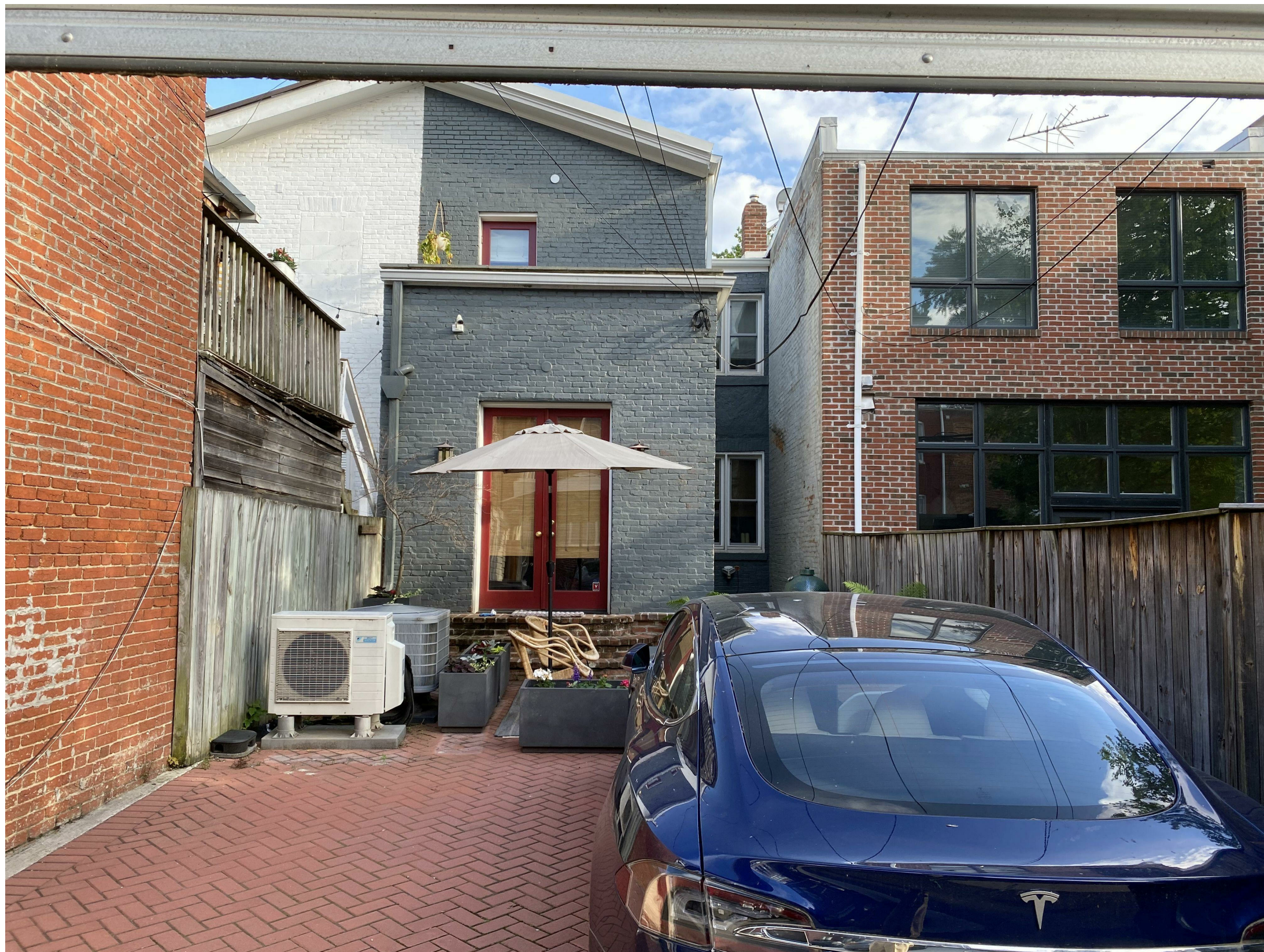
REAR YARD VIEW