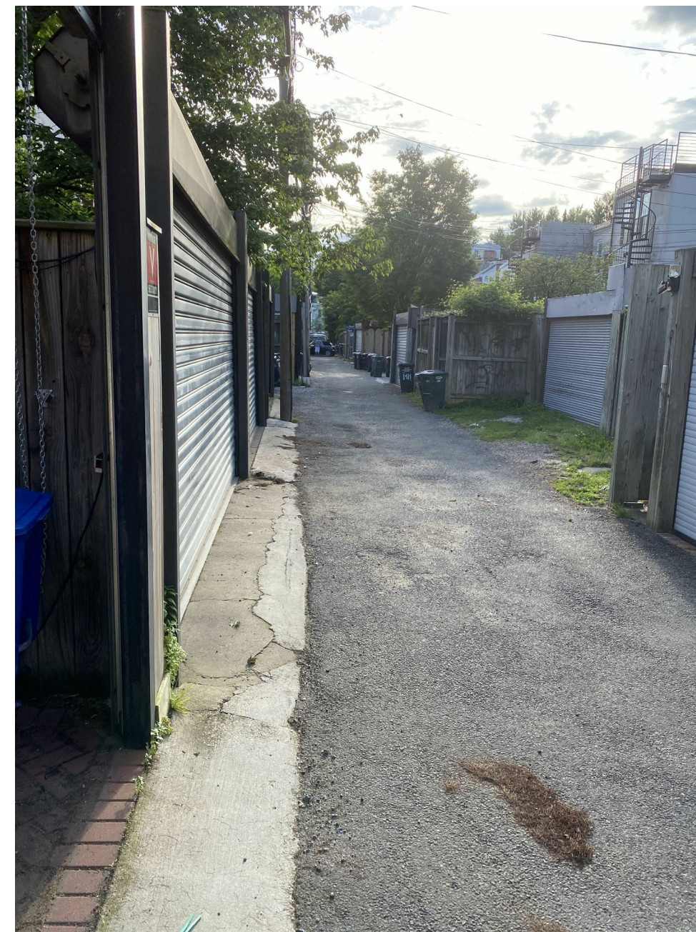
VIEW OF ALLEY