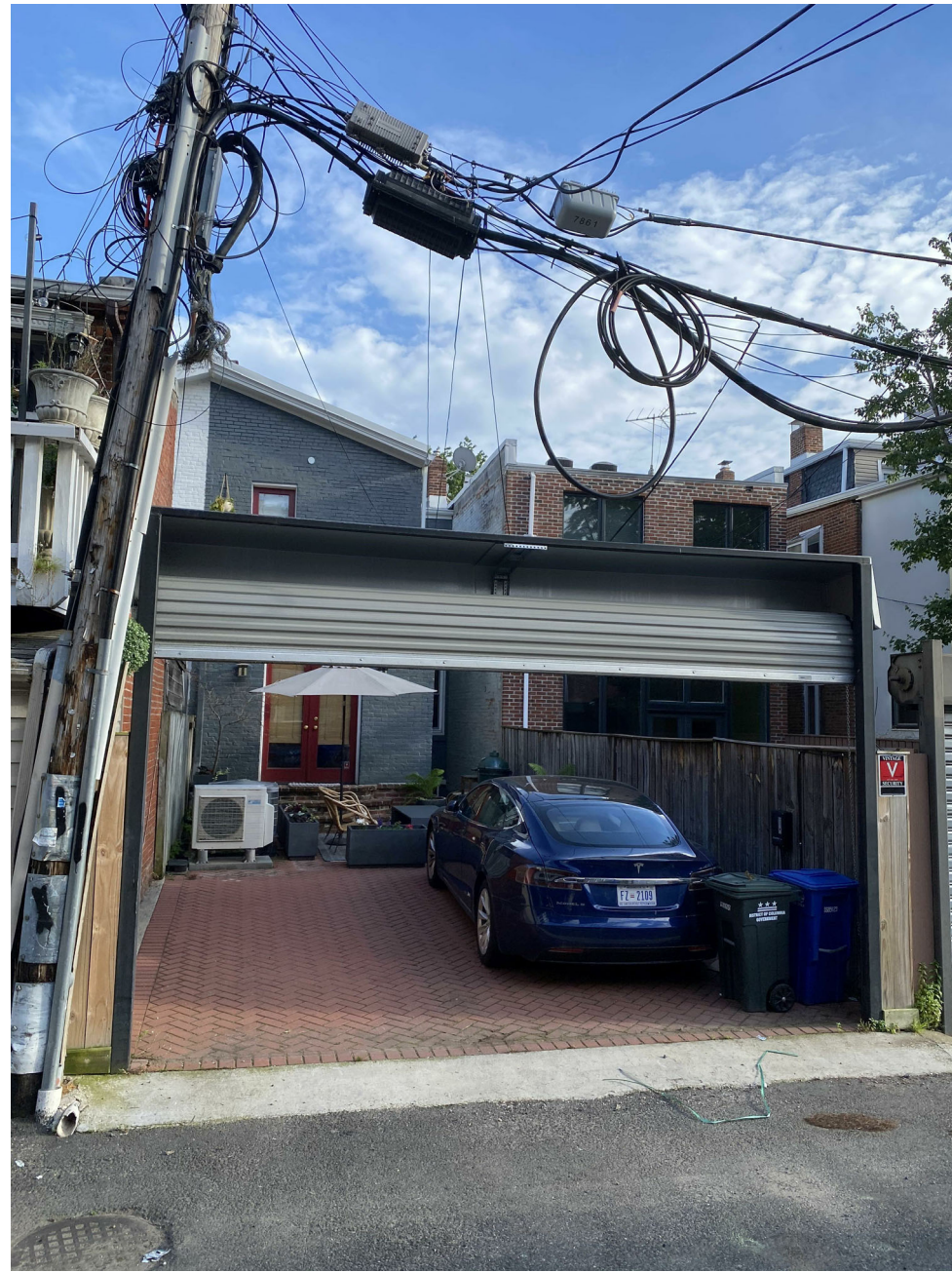
VIEW FROM ALLEY